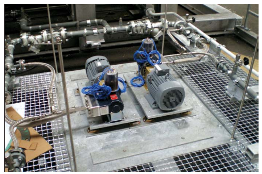
Hydra-Cell G03 pumps installed in a new unit for Romgaz, now under construction in Germany by E.M.S.

diaphragm pump manufactured by Wanner Engineering (and marketed in India by Machinomatic Engineers, of Mumbai). It offered substantial advantages in terms of flexible performance, compact size, perceived noise reduction and lower life cycle costs. – combining these features with accuracy and established reliability. It enabled E.M.S. to explore the possibilities of a more progressive pumping solution, and it was eventually specified for pumping TEG in each of the twelve new dehydration plants.