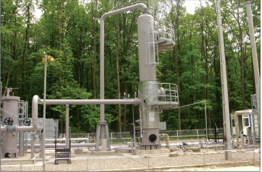
Accurate and reliable delivery of recovered glycol (TEG) to the top of the absorber vessel is critical at this final stage of gas drying.

It happened that about the time when plans for the Romgaz project were at pre-contract stage, an interesting alternative type of pump had been brought to the attention of E.M.S. by specialist supplier Verder Deutschland. This was the Hydra-Cell, a hydraulically balanced multi-