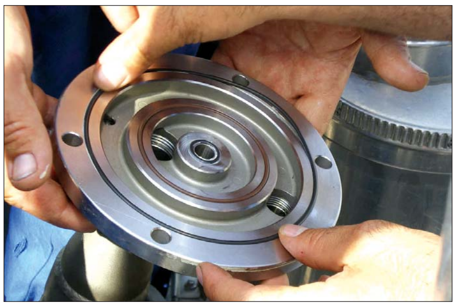
Simple build, low maintenance. This Hydra-Cell pump manifold inspected by Romgaz engineers after 1800 hours continuous operation showed no signs of wear.