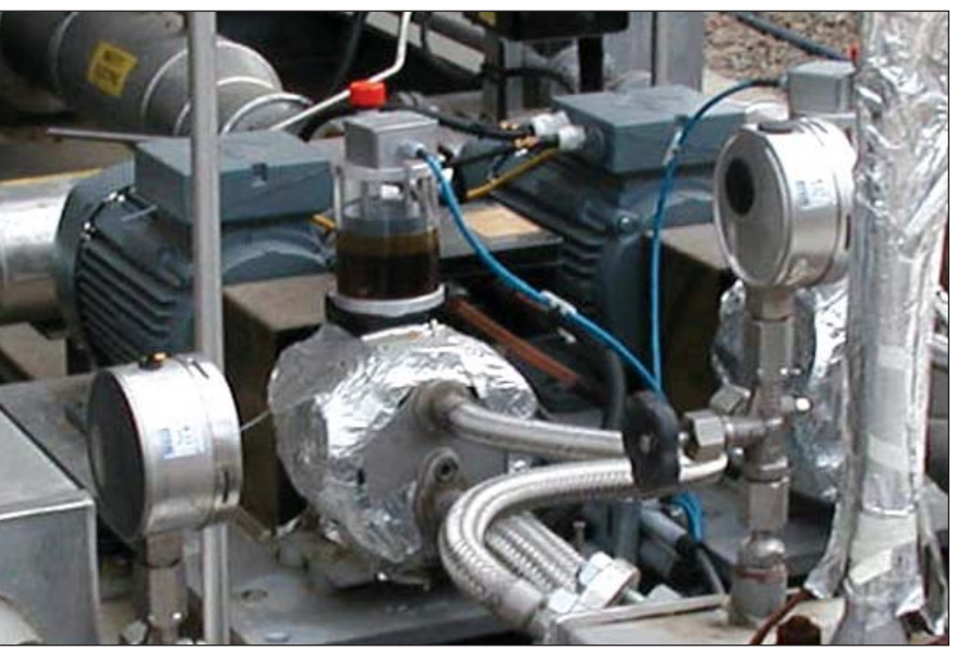
Compact pump design is a bonus where space is tight. Foil wrap holds in place trace heating cable on a Hydra-Cell G10 TEG pump – a reminder that Romanian winter temperatures fall as low as minus 30°C.